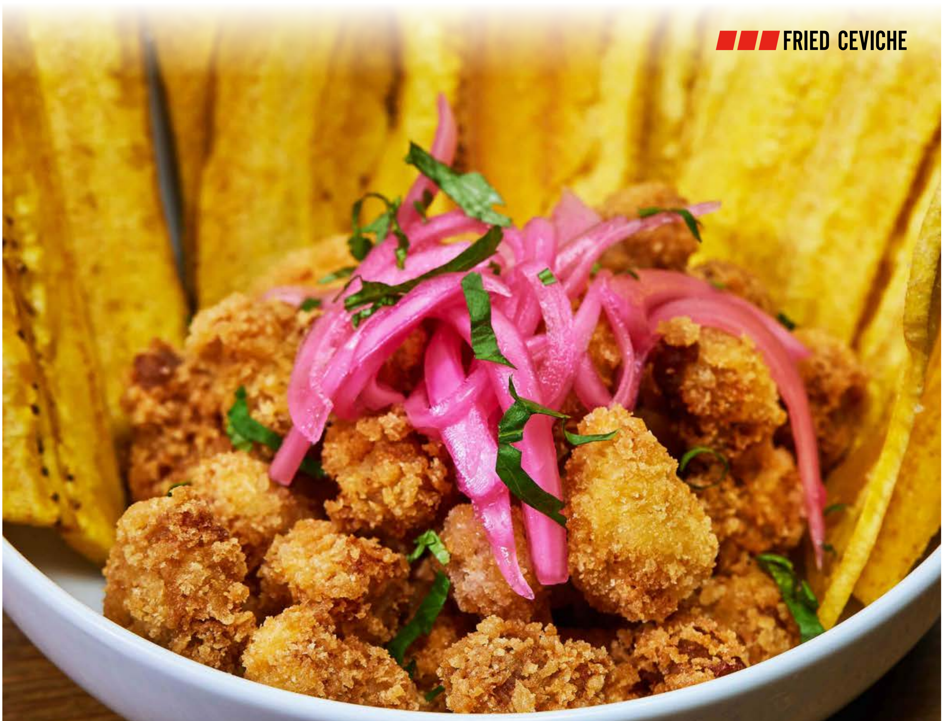
//// FRIED CEVICHE